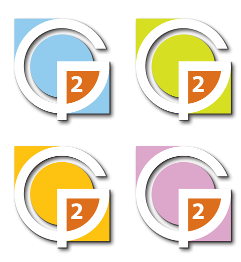
Section 2: Work Package reports